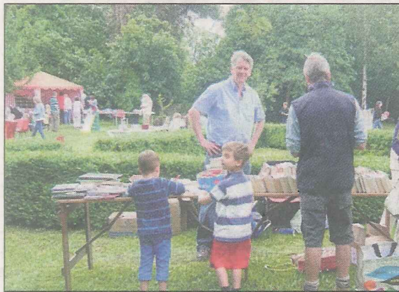
Urban village: St Mary's boasts a church fête, above, a cricket club, a grammar school – and a 31 per cent house price hike